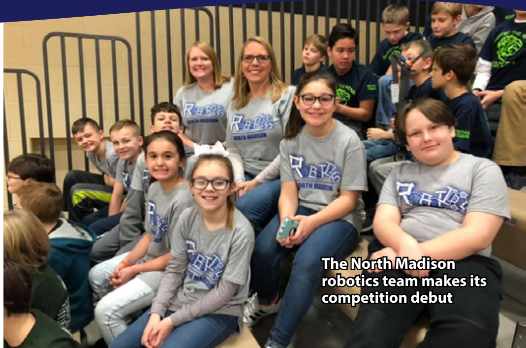
The North Madison robotics team makes its competition debut