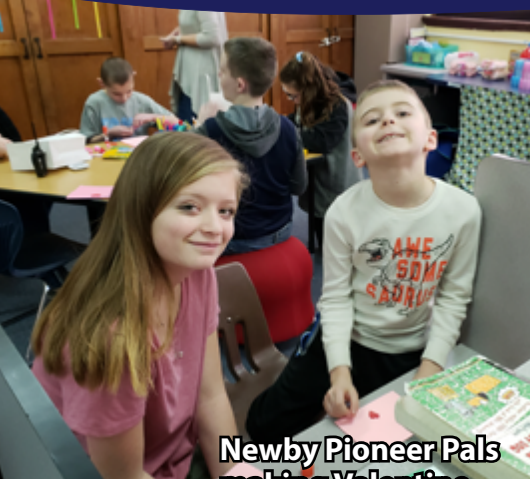
Newby Pioneer Pals making Valentine cards for residents of Miller's Merry Manor