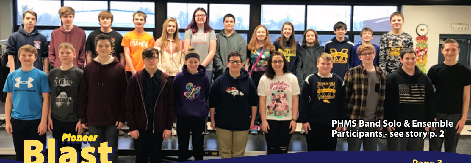
PHMS Band Solo & Ensemble Participants - see story p. 2